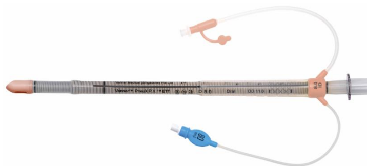
Figure 2 Venner PneuX™ device - an advanced airways protection system

An advanced airways protection device consists of a flexible ETT with ports for subglottic suction/irrigation as well as a port to attach to an electronic system to maintain cuff pressure. The Venner PneuX™ device was recommended for testing in a large scale clinical trial by NICE in MTG48[5]. It is the only advanced airway system currently available in the NHS. Venner PneuX™ device is available in various sizes. We will test this system and the findings will be generalisable to future devices with similar design features and capabilities.